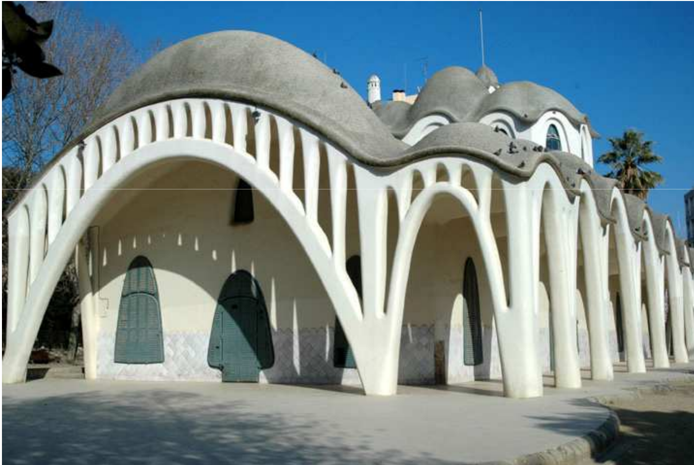
LA MASIA FREIXA

HE RENOVATED AN OLD FACTORY, BUILT BY HIMSELF, AS A PRIVATE HOUSE. THIS IS ONE OF HIS WELL KNOWN BUILDINGS